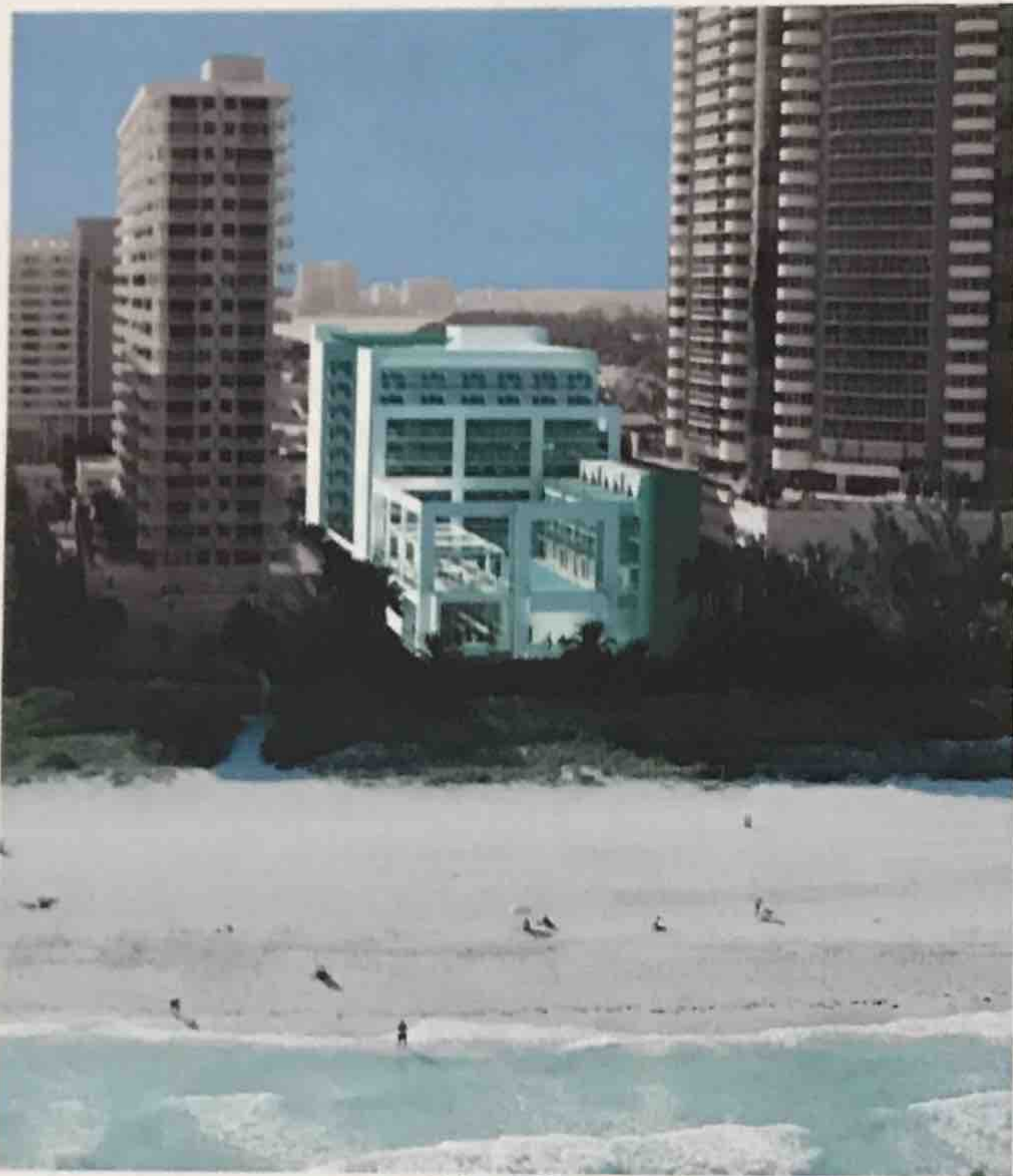
Cabana Ocean Front View - Artist's Concept

6000 Collins Avenue, Miami Beach • www.cabanaoncollins.com