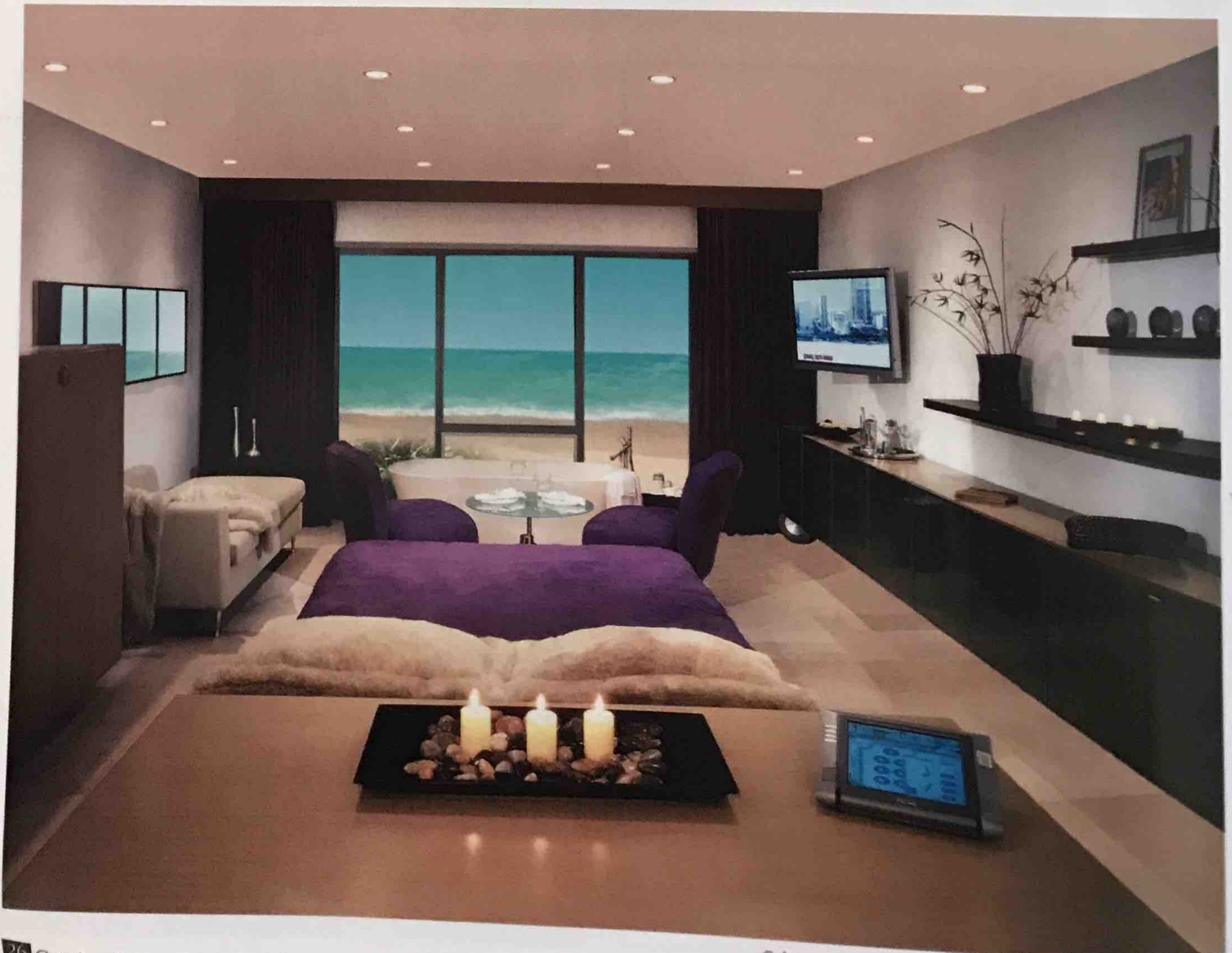
Cabana Interior - Designed by Teri D'Amico Design Associates

The project features 210 luxury turnkey "studio" retreats that include every high-end creature comfort imaginable: from a 42" plasma TV with retractable mount, a state-of-the-art surround audio/video system and remote touchscreen smart technology with fingerprint entry, to appliances, fixtures, linens, and furnishings. Custom-made designer cabinetry, imported stone, glass and exotic wood finishes grace each residence. In addition, each unit has a completely accessorized kitchenette and bar facility to enhance an elegant lifestyle. Among the building's highlights are a dramatic 10,000 square foot indoor-outdoor restaurant and lounge with translucent glass exposing the pool & sundeck above, a 6,000 square foot European style spa and fitness center, an elevated