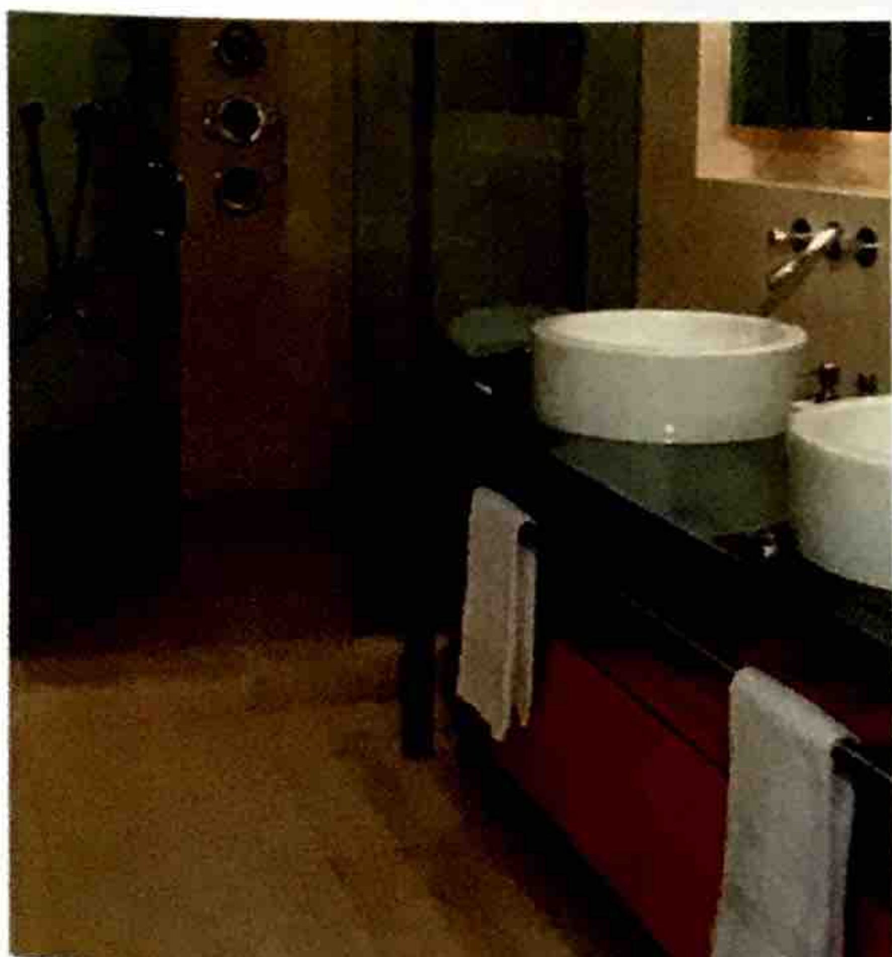
Actual Master Bathroom